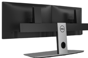
DELL DUAL MONITOR STAND | MDS19

Enjoy toolless monitor installation with Quick Release and the flexibility to pivot, tilt, swivel and adjust the height of each monitor independently. Features a small footprint and neat cable management.